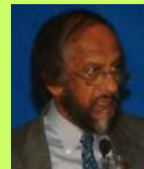
Dr. R.K. Pachauri D.G. TERI